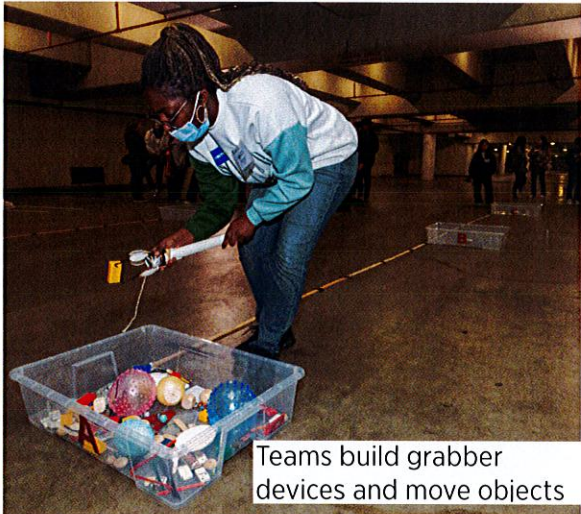
Teams build grabber devices and move objects